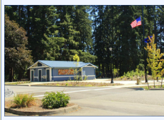
Pioneer Park (Entirety)