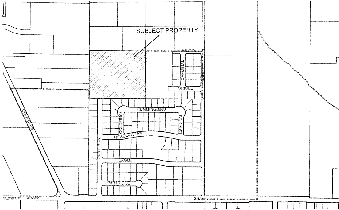
EXHIBIT 2, Map of Annexed Territory